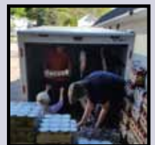
2020 Programs pivot yet never cease during pandemic