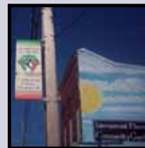
2012 First murals, banners, & more grace Little Italy