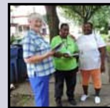
2014 SSJNN expands East, across the heart of Erie