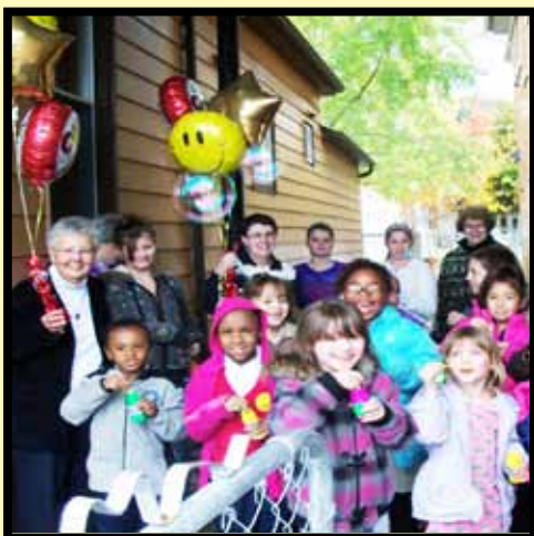
10th Anniversary of SSJNN