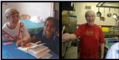
2001 First ministries of youth programs & soup kitchen thriving thanks to many dedicated volunteers