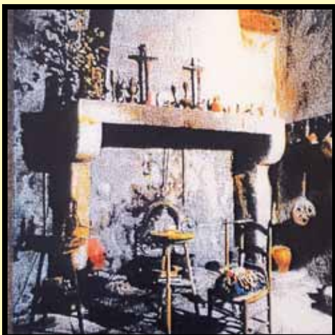
Hearth in Le Puy, France, SSJ Beginnings