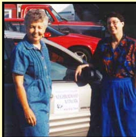
The Initial “Office”, Little Italy, Erie