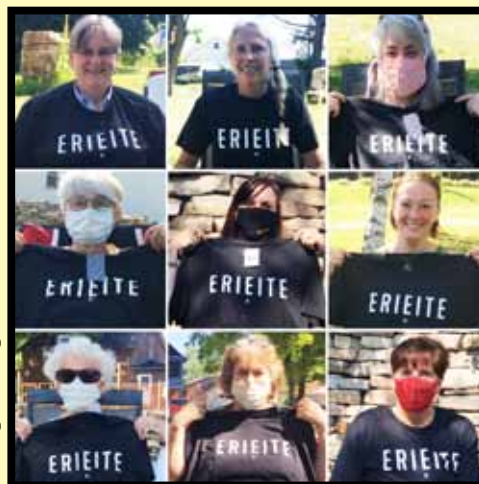
Celebrating 20 Years A-Blaze