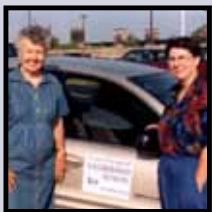
2000 Meeting neighbors door to door