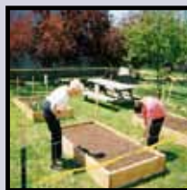
2008 First community garden established