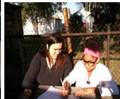
15 children improved their grades