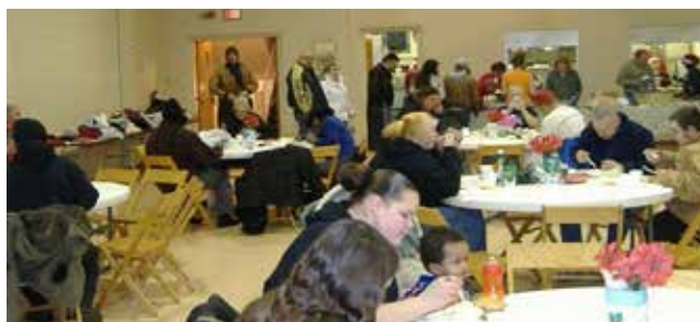
Over 5,000 meals were served