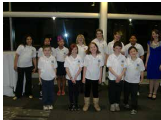
16 children participated in choir