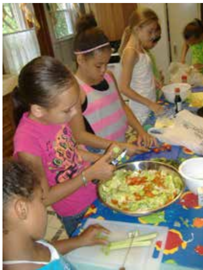
60 people grew what they ate & 30 children cooked what they grew