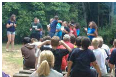
21 children went to camp

These are just a few of the things you made possible through your generosity. There are many more and the people you have helped are forever grateful.