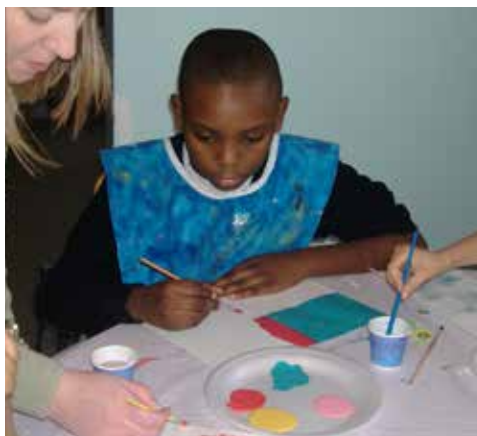
50 children created Art