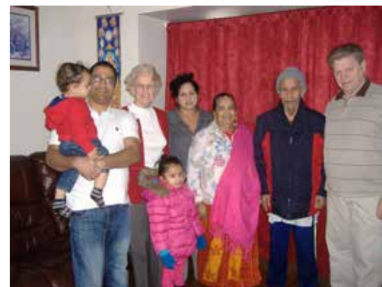
15 people received housing services