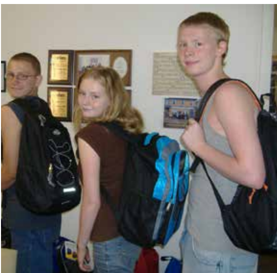
50 children received backpacks and school supplies